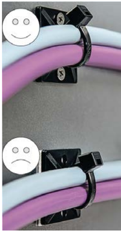
Figure 2. Wiring Routing – Reference only

3.4.7. Electronics Box component layout shall be subject to approval by the Authority. The electronics box layout shall be consistent across the fleet. The contractor shall not use adhesive cable tie mounts for wiring routing unless secured with screws. The contractor shall maximize the electronics box space as the Authority intends to install additional components such as radio, camera system, router, etc.