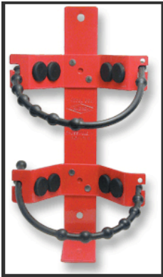
EXHIBIT F - TECHNICAL SPECIFICATIONS